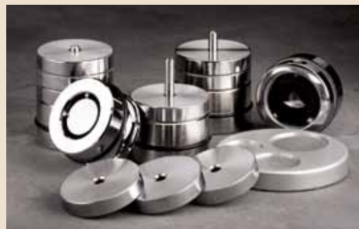
A variety of specimen holders and weights are available.