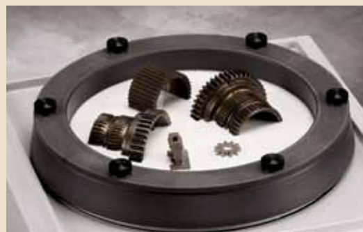
Large mounted specimens may be polished with ease. Once loaded, specimens require little operator attention.