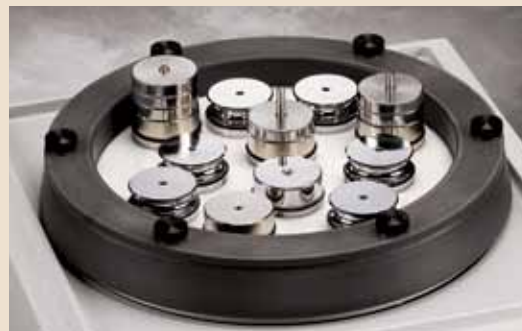
Generous specimen capacity allows up to 18 specimens to be prepared simultaneously.