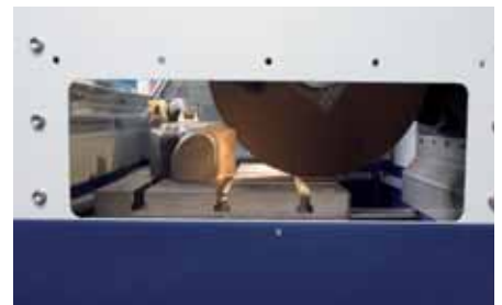
The windows on the sides can be removed in order to cut long samples.