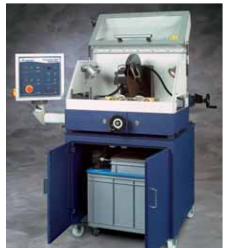
An optional steel-cabinet provides enough space for a large recirculating system. The hood can be opened wide thus providing optimal access for positioning and clamping of the samples.